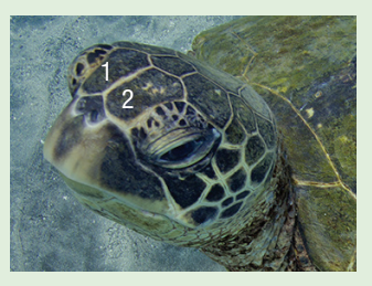
2 pre-frontal scales (between eyes)

Hawksbill Ea / Honu`ea Eretmochelys imbricata